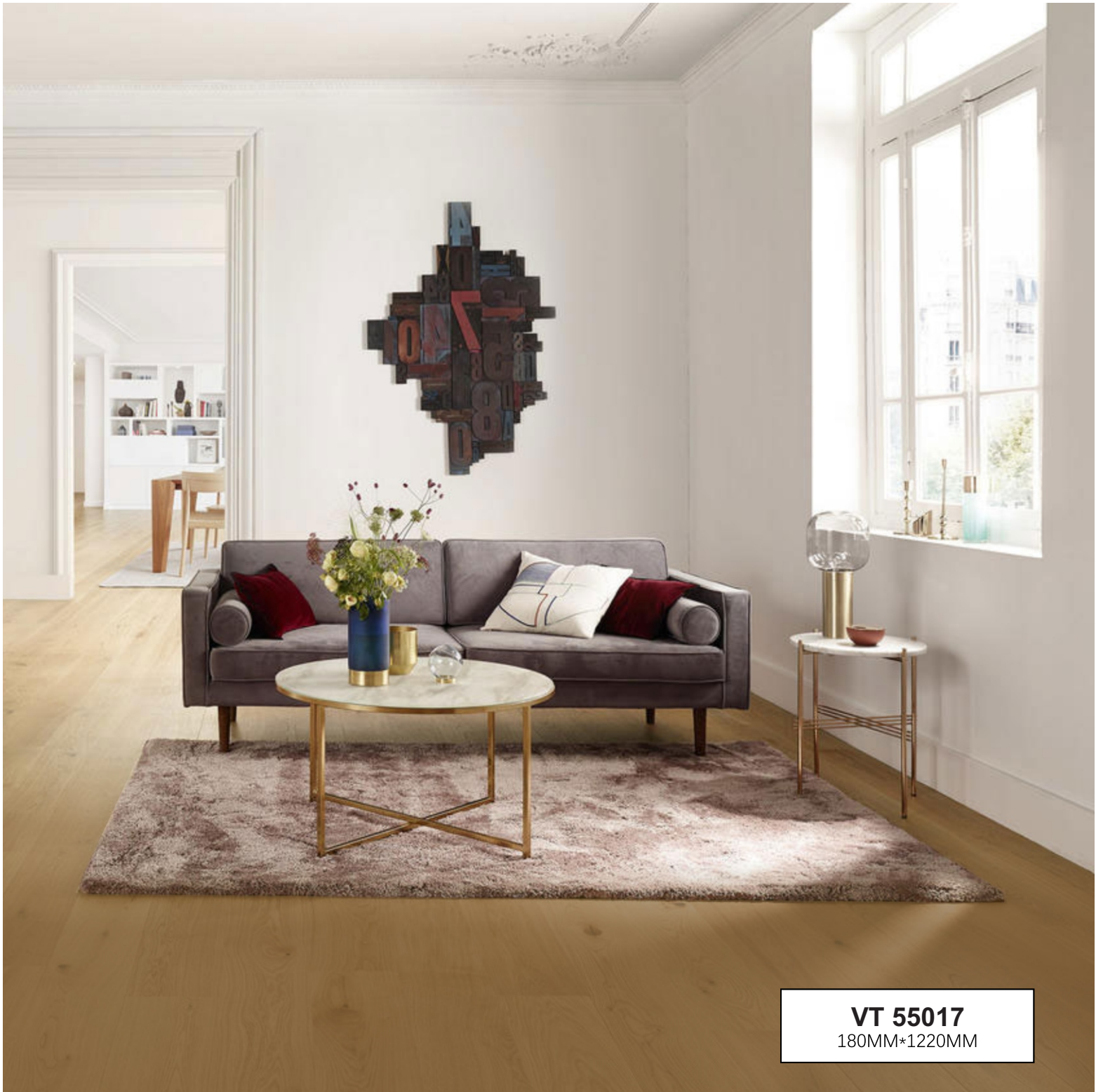
VT 55017 180MM*1220MM