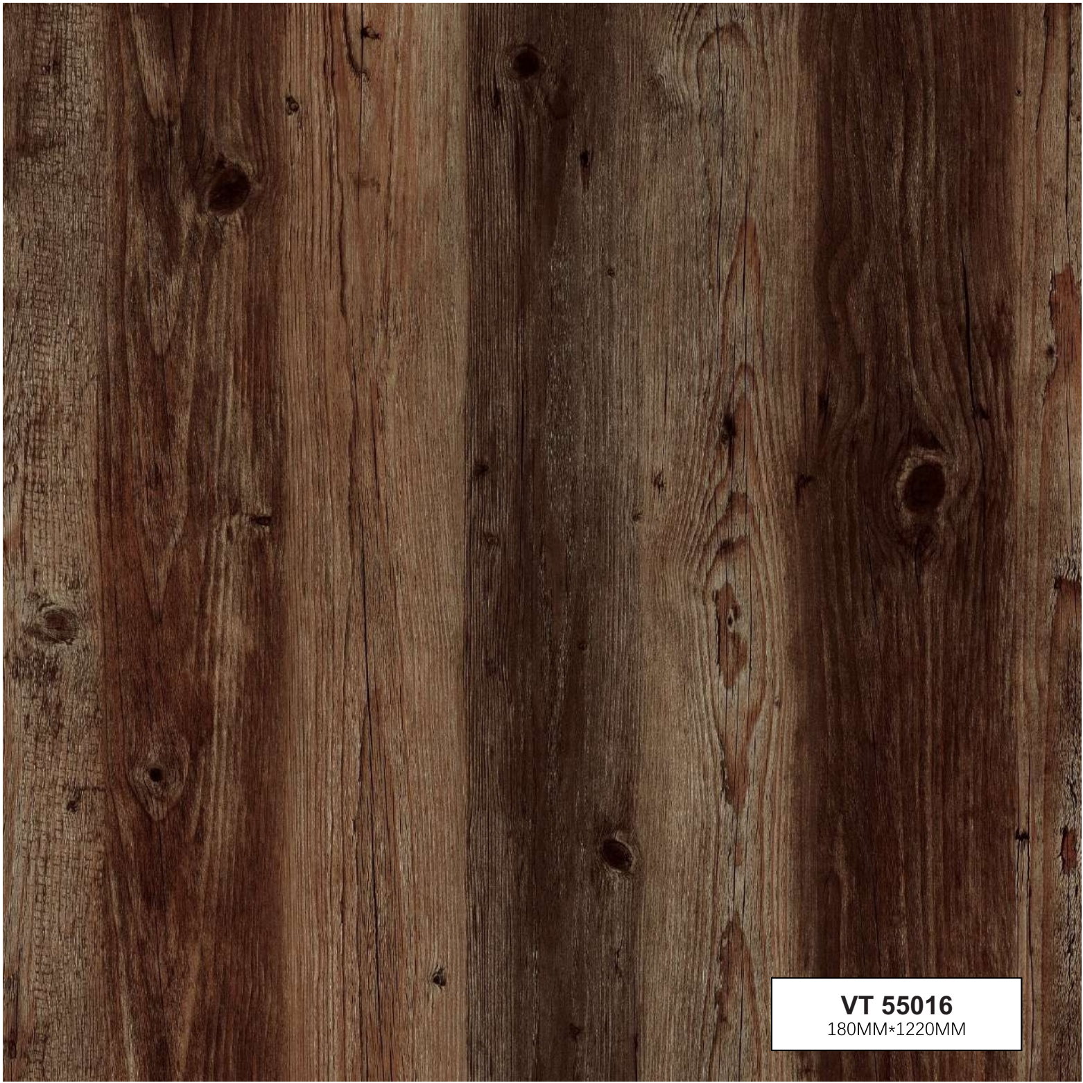
VT 55016 180MM*1220MM