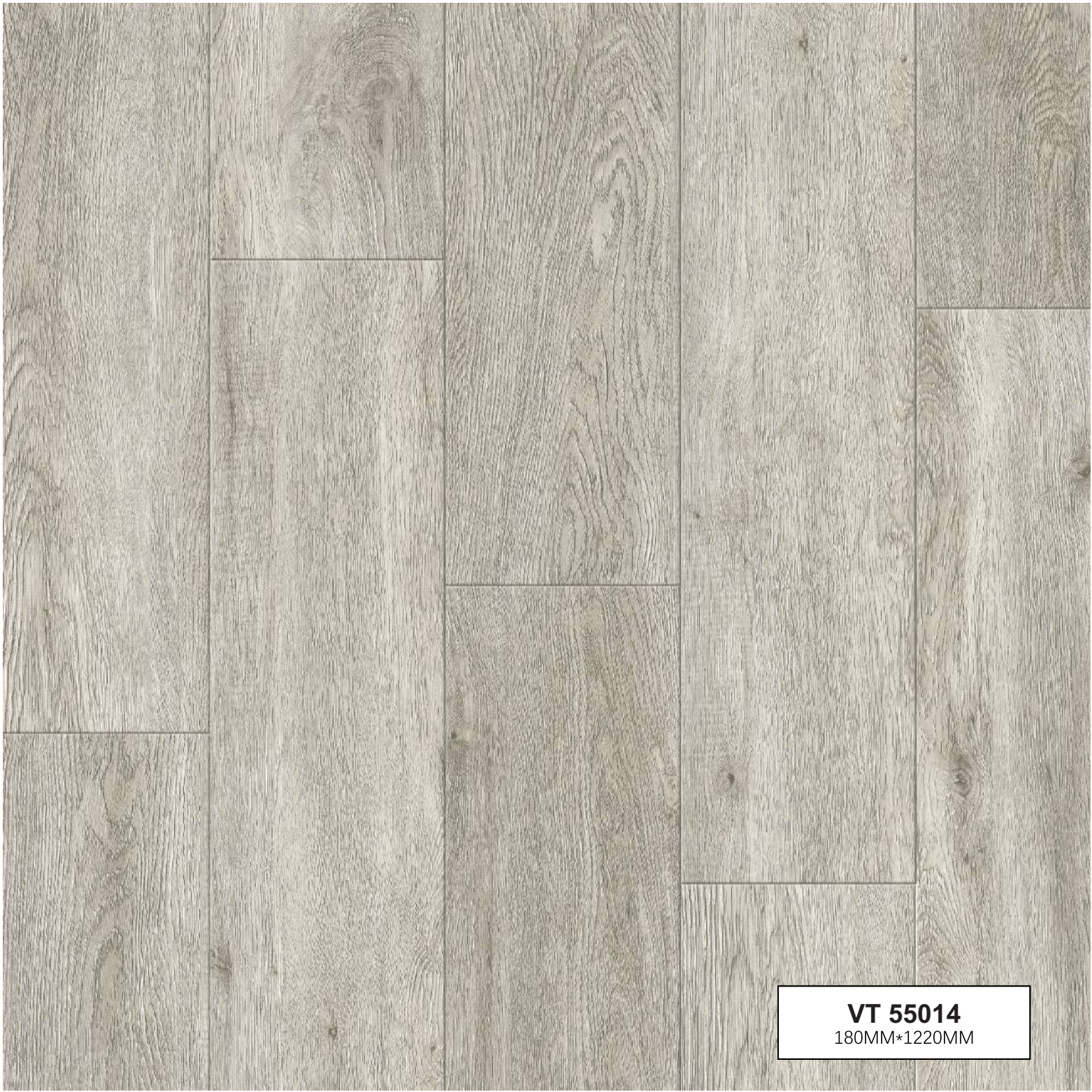
VT 55014 180MM*1220MM